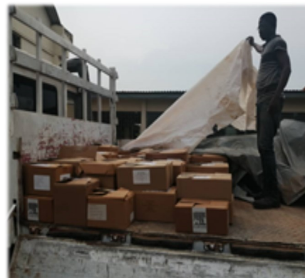
Books for the library collected from Tema