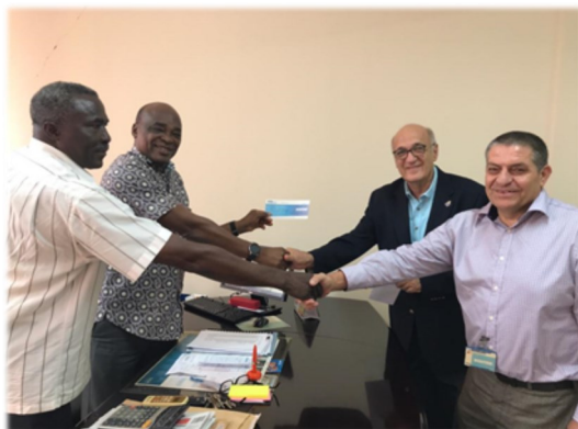
At the office of the President of Kodzi-Delta Development Union

has been able to assist with the library project by providing more than 1000 books for the library and a contribution to the funds needed for the completion of the building and in particular of its library